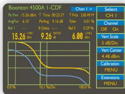
CCDF of 8 carriers spaced 700 kHz apart from 1.8 GHz to 1.8049 GHz and phase aligned for highest peak power.

The same histogram data can be used to display the complement of the CDF or CCDF, which is also called the 1-CDF because of the manner in which it is calculated. For every possible power level (p) within the total dynamic range, the CCDF shows the probability in percent that the measured power is greater than p. This definition flips the CDF curve from left to right placing the maximum power value on the zero percentage axis. This form is often more convenient to use, but contains the same information as the CDF.