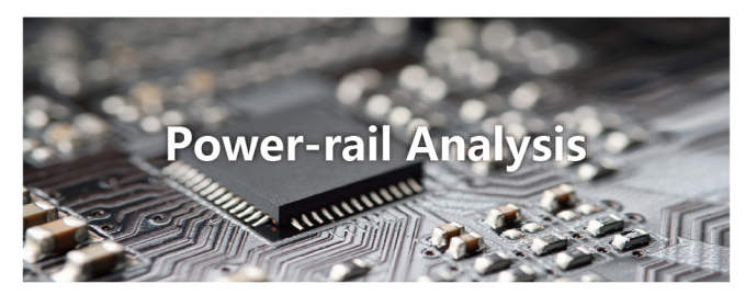
It sees intricate signal details by providing up to 4 GSa/s sample rate, 12-bit vertical resolution as well as higher DC gain accuracy.