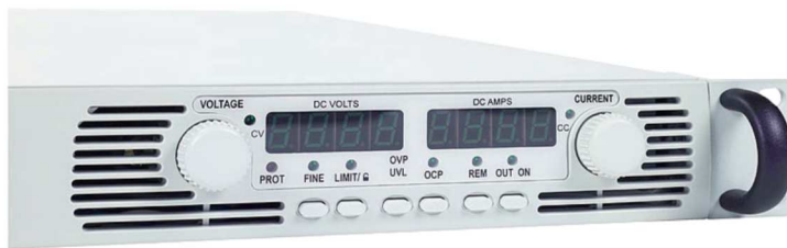
Figure 1. Front-panel control knobs and buttons make it easy to use N5700 power supplies.

You can quickly and easily operate the power supply with its rotary knobs and buttons. Using the front-panel controls, you can make coarse or fine adjustments of output voltage and current, protection settings, and set power-on states (last setting memory or factory default setting). The output voltage and current are displayed simultaneously, and LED indicators show power supply status and operating modes. You can lock the front panel controls to protect against accidental power-supply parameter changes.