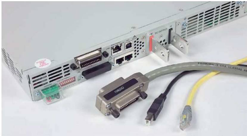
Figure 2. Built-in Ethernet, USB 2.0, and GPIB interfaces enable easy system connections.