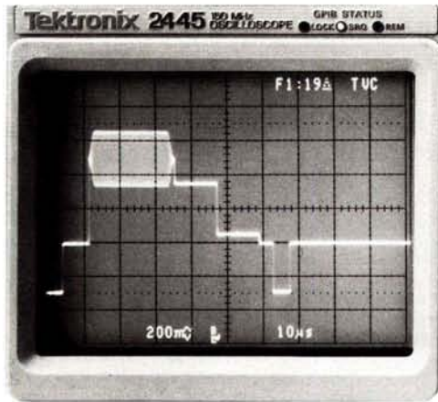
This sample waveform and CRT readout show a 2445's high-fidelity display of the Vertical Interval Reference Signal on Line 19, Field 1 with the television blanking-level clamp (TVC) engaged. The instrument used is also equipped with Option 10 ( GPIB).

Back-porch clamp circuitry delivers a stable display of composite video, even when signals are characterized by changing average picture level and low frequency hum.