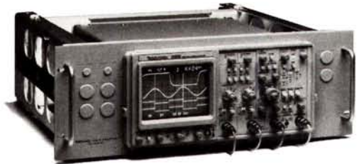
Rackmount 2465 Option 1R comes complete with slide-out chassis tracks.

M5 — (2445) 9 Calibrations +2 Years Service ..... +$1,295