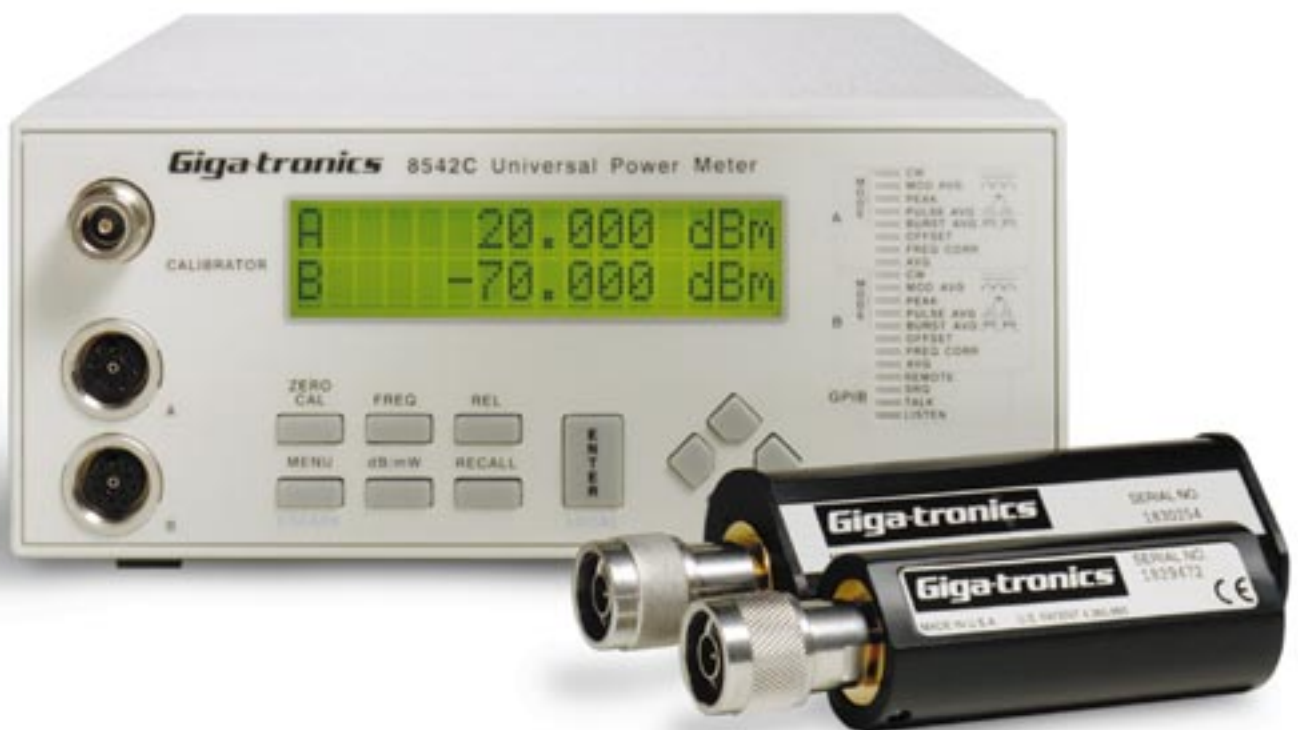
The Giga-tronics 8540C Series combines the speed, range, and capabilities needed to test today's sophisticated communications systems.

The exclusive Time Gating feature of the 8540C lets you program a measurement start time and duration to measure the average power during a specific time slot of a burst signal. This is critical for accurately measuring the average power of GSM, NADC and